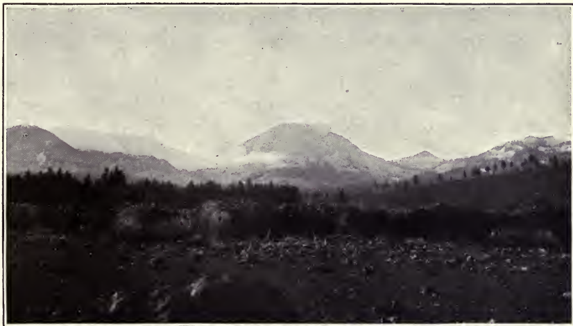
View of Lassen Peak looking southeast from near Manzanita Lake. A small jet of steam from the crater is being blown to the south

Lassen Volcanic National Park, California